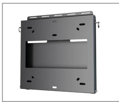
Low Profile Design The T4400ADA holds display a mere 2.2 inches from the wall