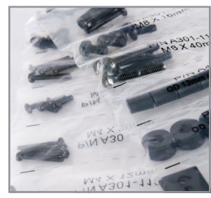
Mounting Hardware Complete set of mounting hardware, labeled for ease of use and ready to go.