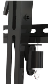
One touch lock and key system for added security