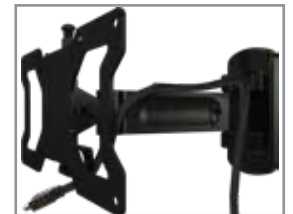
Cord Management Integrated cord management for clutter-free installation.