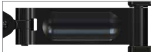
Pivoting Arm 2 pivot joints for variable viewing angles.

VESA Compatible Compatible with 75X75mm, 100X100mm & 200x100mm compatible.