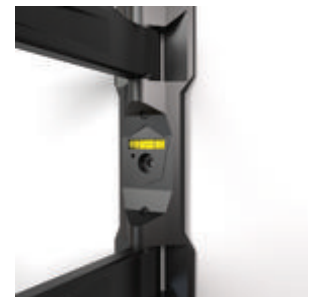
3 Attachment points and a built in level