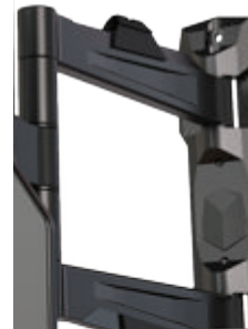
Decorative covers hide screw heads